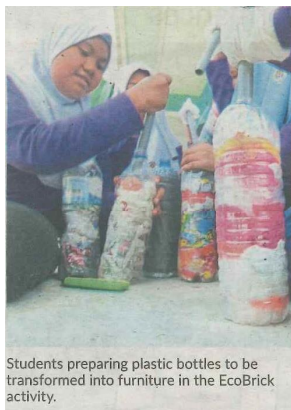
Students preparing plastic bottles to be transformed into furniture in the EcoBrick activity.