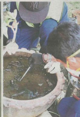
An MPKJ search-and-destroy programme in progress.