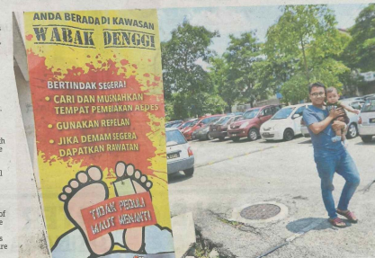
Banners at dengue outbreak areas are a common sight in many parts of the Klang Valley.

Selangor authorities worried as more than half of nationwide cases have occurred in the state