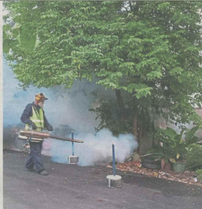
MPS Health Department personnel fogging a neighbourhood.