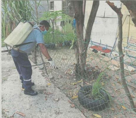
An MPS worker conducting larviciding at a neighbourhood.