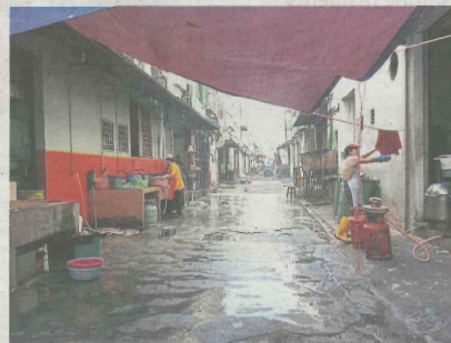
Restaurant workers using the back lanes to do washing, leading to fat, oil and grease being washed into drains at Bandar Bukit Tinggi, Klang.

"Most of the restaurants in these areas set up their kitchen in the back lanes and the FOG are washed straight into the drains," he said.