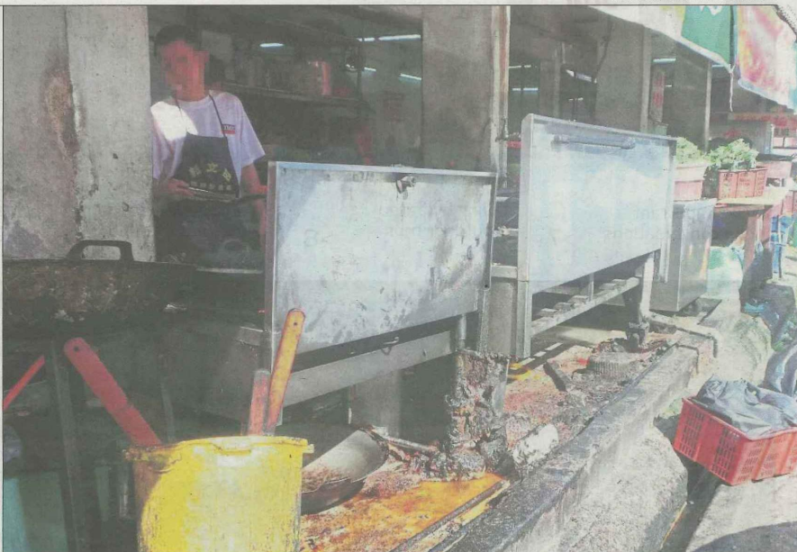
Fat, oil and grease are carelessly released into the drains at a restaurant in Bandar Bukit Tinggi, Klang.