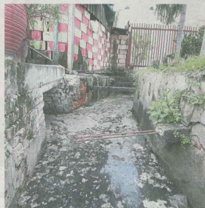
Cooking oil is dumped into drains causing the water channel to be blocked.

Based on his observation during clean-up efforts, Mazlan said an