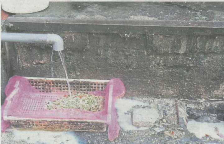
A restaurant in Bandar Bukit Tinggi uses a plastic bag and a container instead of proper grease traps to sieve food residue.

"Hygiene levels are also being looked into," he said.