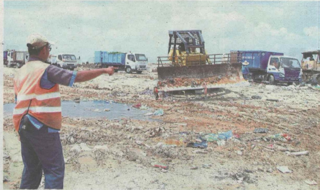
The 67ha Jeram landfill houses an electricity power plant that produces electricity from the greenhouse gases released by the rubbish as well as a leachate treatment plant.

Company plans to increase lifespan of landfills to cope with growing amount of rubbish being generated daily