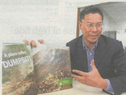
Zamri says closed landfills cannot be used for other developments including housing projects as it requires different methods of treatment, so the park idea is ideal.

OLD landfills that have reached their maximum capacity are often treated as dead zones, unfit for human occupation or activities due to the gas produced from decomposing waste. However, Worldwide Holdings Bhd has come to the rescue. The company has successfully rehabilitated three landfills namely in Air Hitam in Puchong, Kubang Badak in Kuala Selangor and Sungai Kembong in Hulu Langat. The 40ha Air Hitam landfill has been turned into a park since 2011 for the community called the Worldwide Landfills Park Air Hitam. Five years after its closure in 2006, the place had over six million tonnes of hidden waste. It housed a 5km-long jogging track, a bicycle track and a playground. Joggers are also allowed to track uphill and people are known for flying kites and enjoying the magnificent view from the garbage hill that is now green and lush. Noticeable among the greenery are 164 gas wells that still carried greenhouse gas to the renewable energy power plant that supplied electricity to 2,000 homes nearby. There is also has a leachate treatment plant at this place