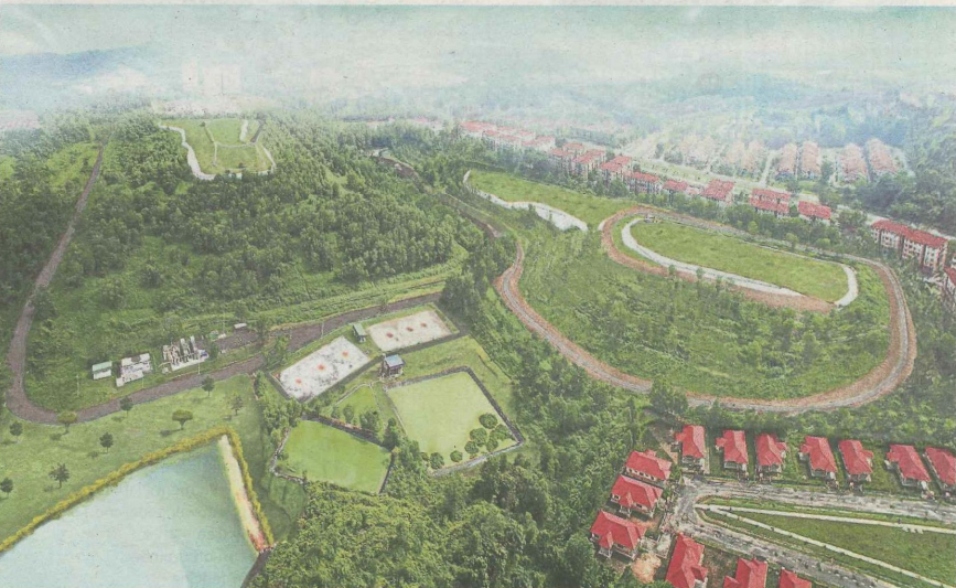
An aerial view of the Worldwide Landfills Park Air Hitam, Puchong which has been repurposed.

Waste water, added Zamri, needed careful handling by