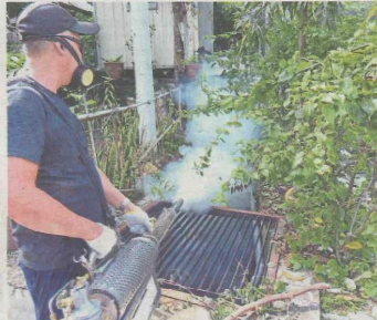
An Ampang Jaya Municipal Council staff fogging an area in Taman Bukit Permai.