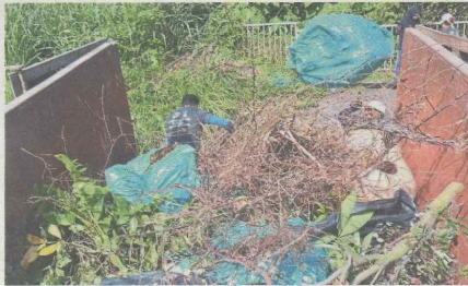
To combat dengue, constant clean-ups are needed as even leaves and roots can become Aedes breeding sites.