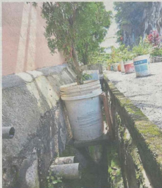
Drains that are blocked with potted plants make it more difficult for cleaning works to take place.

By SHALINI RAVINDRAN shaliniravindran@thestar.com.my