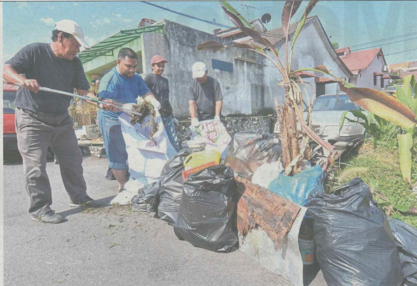
Residents clearing up rubbish around their neighbourhood in Taman Bukit Permai, Ampang to get rid of potential mosquito breeding grounds.