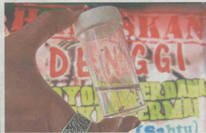
PKD Hulu Langat's dengue control strategies include a 12-week programme on how to search and destroy mosquito breeding grounds.

Selangor earmarks extra RM5mil on war against dengue in 2018 after recording the most number of cases in the country this year