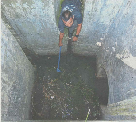
Drains such as this are ideal mosquito breeding spots as it has clean stagnant water. Regular clean up is needed to ensure that garden debris from the drains is cleared.