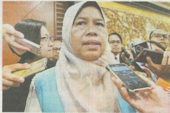
ZURAIDA ketika ditemu bual di lobi Bangunan Parlimen.

Menteri Perumahan dan Kerajaan Tempatan, Zura-