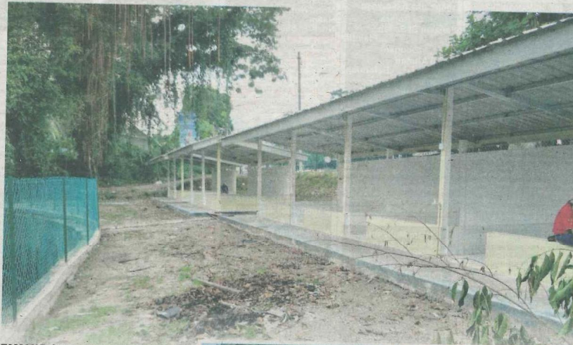
TAMAN Rekreasi Kucing MPAJ yang didakwa akan beroperasi sebagai Pusat Khidmat Rakyat di Jalan Kerja Ayer Lama, Ampang Jaya, Selangor.

"Taman rekreasi itu sepatutnya beroperasi sebagai tempat perlindungan kucing terbiar di kawasan ini tapi usaha itu nampaknya tidak akan berjaya," ka-