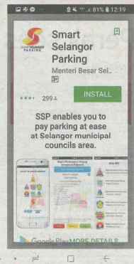
The Smart Selangor Parking App (SSPA) is easily available on Google Play and the Apple App Store.

authorities. "They were also required to use different coupons for different areas and those who travelled a lot would have to carry several coupon booklets with them. "Some areas still use parking machines and motorists also found it a hassle looking for coins and dealing with faulty machines," he said. Ng said the SSPA was introduced