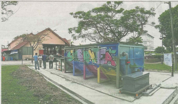
The anaerobic digester system installed beside the Dengkil Food Court