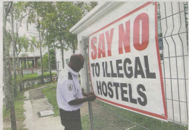
Guidelines on illegal hostels are being drawn up by the Selangor government.