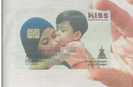
An additional 5,000 people will receive benefits with the KISS card, bringing the total to 25,000.

The Smart Selangor Parking app allows users to pay for parking and compounds online for most councils in Selangor.