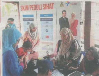
Recipients of the Peduli Sihat scheme have increased to 85,000.