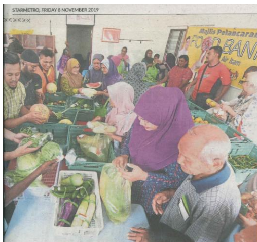
Selangor will start its inaugural food bank for the urban poor with a RM5mil fund.