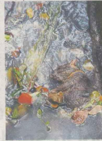
A dead rat in a drain in SS19, Subang Jaya, UluT is filled with food waste from restaurants nearby.

"The shop should be sealed for at least two weeks to allow health inspectors to check and determine the premises is not contaminated. Simple cleaning may not get rid of all the bacteria present," he pointed out.