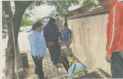
MBSA contractors cleaning the drains along Jalan 25/43 and Jalan 25/44 in Taman Sri Muda to prevent floods in the area.

The most recent flood occurred last month along Jalan 25/44 and Jalan 25/43 near the commercial lots where workshops are aplenty. StarMetro highlighted the plight of the workshop owners who said customers were unable to access their premises during flash floods, resulting in loss of business.