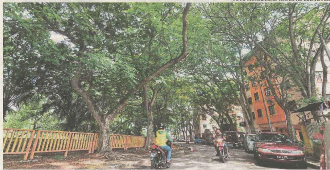
Penunggang motosikal melalui bawah rimbunan dahan pokok yang boleh mendatangkan bahaya sekiranya tumbang pada bila-bila masa berhampiran Rumah Pangsa Kampung Padang, Jalan Pokok Mangga.