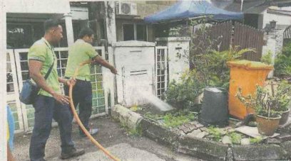
MBSA contractors using water jets to clear the clogged drains in Taman Sri Muda.