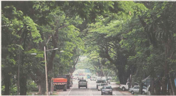
Pokok di Jalan Semambu, Kuantan yang tidak diurus dengan baik boleh mendatangkan bahaya kepada pengguna.