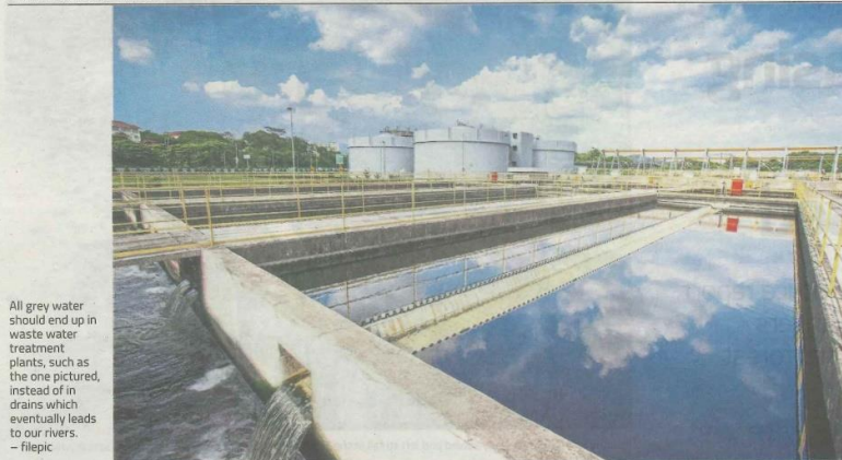
All grey water should end up in waste water treatment plants, such as the one pictured, instead of in drains which eventually leads to our rivers.