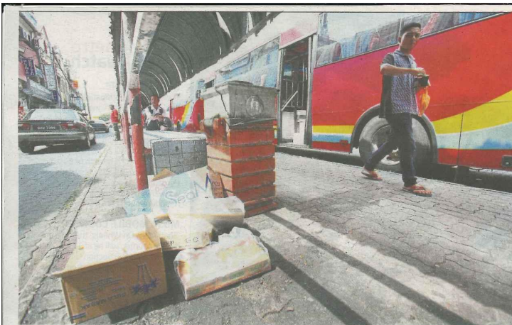
Residents and business owners dump rubbish at the former North Klang bus terminal in Jalan Pos Bahru.