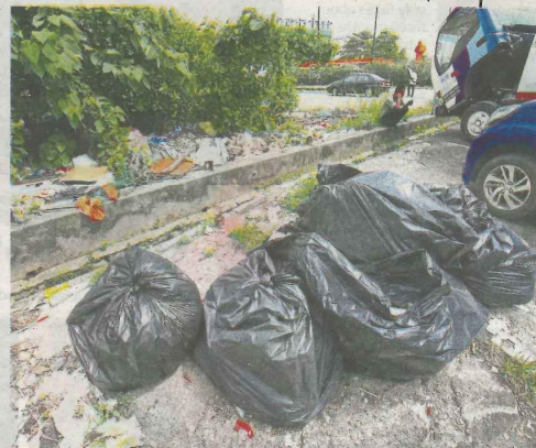
This spot at Persiaran Sultan Ibrahim is a hotspot for waste dumping.

"They should stop throwing rubbish at spots that are convenient to them and instead leave the rubbish at designated spots where garbage bins have been provided by the council," she said.