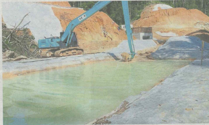
Regular desilting works are carried out at the retention ponds along the EKVE project site.

EKVE developer submits new alignment option for phase 2 to Government