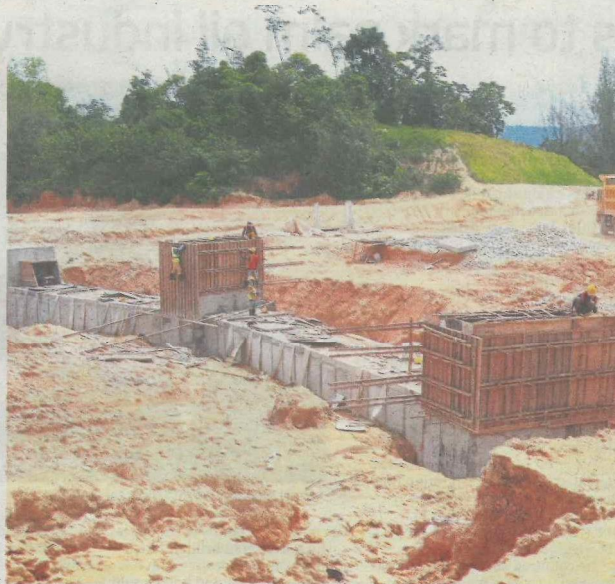
Workers building the base for the elevated EKVE highway.