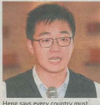
Heng says every country must have policies to reduce single use plastics which could nip the problem at its source.