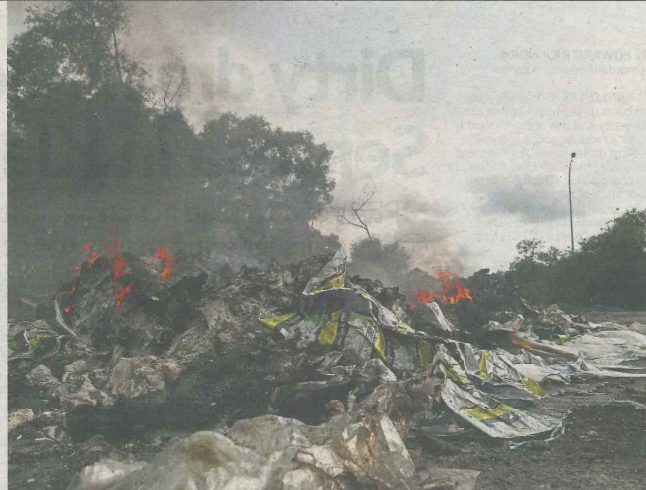
Open burning of plastic waste in Pulau Indah in Port Klang. This photo was taken by Greenpeace Malaysia between October and November 2018.