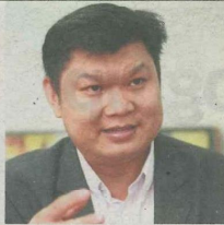
Theng says the issue goes beyond the economic aspect; it concerns human ethics and cross-border pollution.