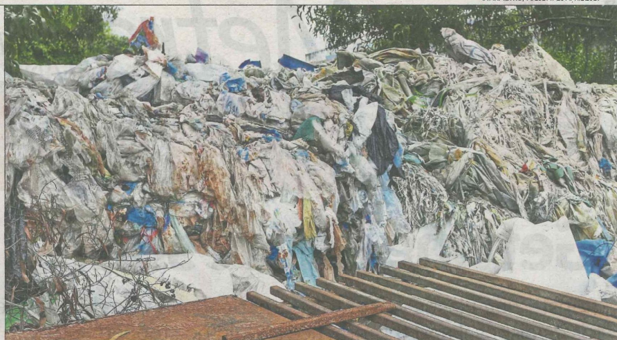
An unregulated dumpsite in Pulau Indah in Port Klang, Selangor.

The Japanese Embassy is calling for entries for the 13th Japan International Manga Award. In an effort to share Japanese pop culture and promote understanding of the country, this award was established in 2007 to honour non-Japanese cartoonists for their contribution to the promotion of Manga culture outside Japan. Application deadline is June 7. For details, visit www.my.emb-japan.go.jp