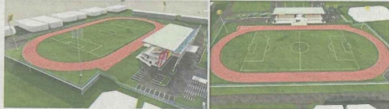
Artist's impressions showing various angles of the stadium.