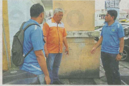
U (in orange) discussing the cleanliness of the drains with workers in Selayang Utama.

"Cleaning contracts are awarded to firms without proper assessment of their capabilities and this is where the local councils in Selangor fail to look into providing good service to the people," he said, adding that drains in Taman