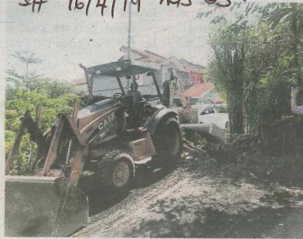
Penduduk Taman Ukay Bistari membantah tindakan MPAJ merobohkan tembok penghadang di Jalan UB2A.

Melalui laporan itu, penduduk juga telah mengadakan beberapa perjumpaan bersama