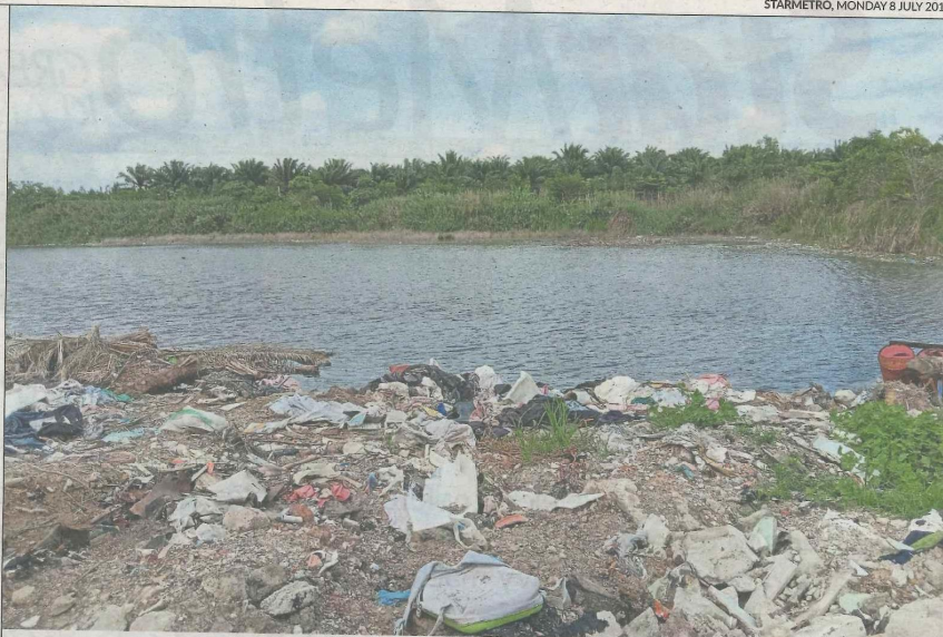
Plastic bags, construction debris, clothes and even a bag can be seen discarded on the shores of the lake near Kampung Baru Sepang.

Registration for Run for Peace 2019 is open. It will be held on various dates throughout September at 28 locations nationwide and is a non-competitive event organised by Soka Gakkai Malaysia. Registration fee is RM30. For details, visit www.runforpeace.com.my