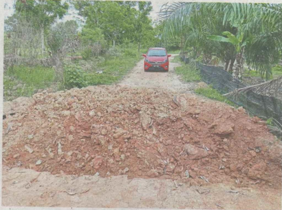
One landowner has built a low wall of earth to stop illegal dumpers from trespassing the land in Sungai Pelek.