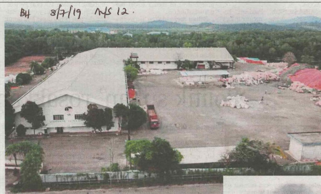
Kelihatan longgokan sisa plastik yang belum diproses serta keputihan asap hitam keluar dari kilang yang beroperasi di kawasan kilang kitar semula, Bakar Arang.

BH sebelum ini melaporkan, kawasan Bakar Arang, Sungai Petani bakal mengalami nasib sama seperti Pasir Gudang beri-