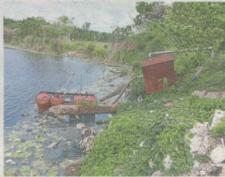
A contraption built at the lakeside for unknown purpose.