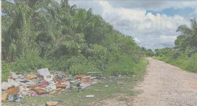
Residents from a village nearby say there is a foul smell from the lake. Rubbish is also dumped at the side of the road leading up to the lake.