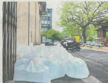
Some restaurant owners have used plastic bags to store water.