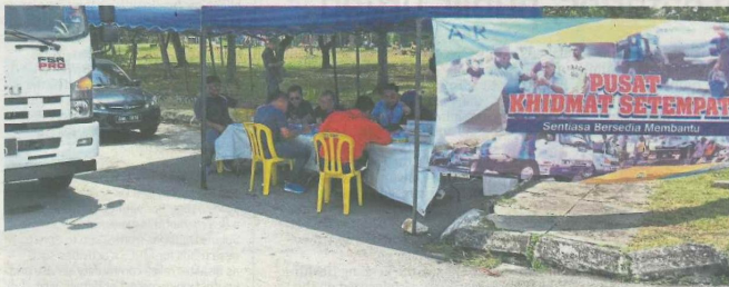
Air Selangor's One-Stop Service Centres will operate round the clock until tomorrow.