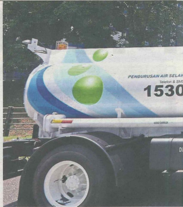
A total of 79 jumbo tankers and 10 water tankers are supplying water to affected areas.