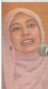
Nurul Izzah is tipped to contest the Pandan parliamentary seat under the PKR ticket.