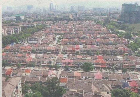
Pandan has a majority of middle- and low-income residents.

THE Pandan constituency has the unique position of being a stone's throw from Kuala Lumpur while retaining the charms of a quaint township.