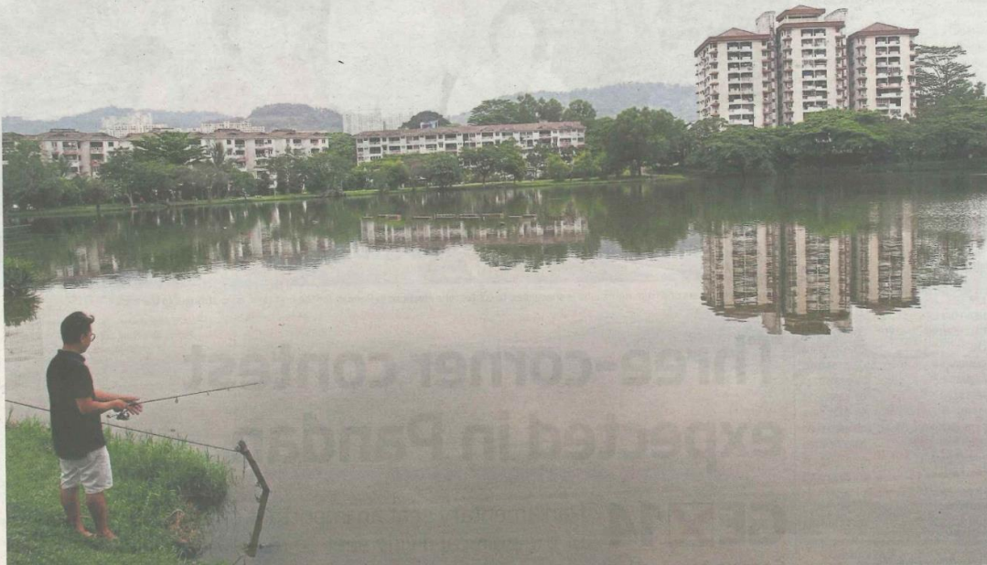
Picture of serenity: A member of the public enjoying a spot of fishing at the Pandan lake in Pandan Perdana.

(03) 7967 1388 ext 1706/1323/1496 (Editorial) metro@thestar.com.my (03) 7966 8388 (Advertising) (03) 7967 2020 (Classified) thestar.com.my/metro facebook.com/starmetro twitter.com/thestarmetro