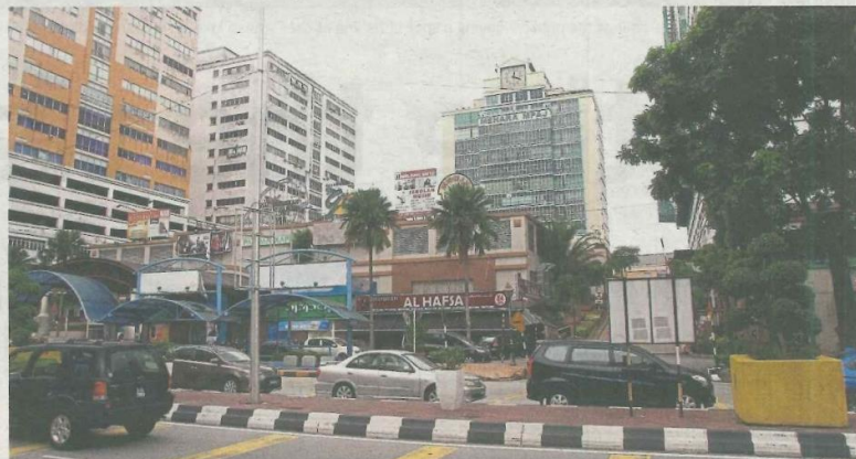
Pandan Indah is a state constituency as well as the capital for the Ampang Jaya municipality.

Parliamentary seat an important one as both sides of the political divide seek to redeem themselves