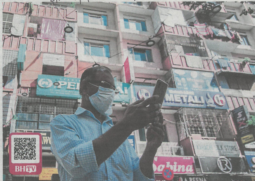
Penduduk yang tinggal di Malayan Mansion keluar selepas kerajaan menarik balik arahan PKPD.

"Mereka bebas untuk bergerak. Sebab itu saya katakan semalam bahawa disebabkan PK-