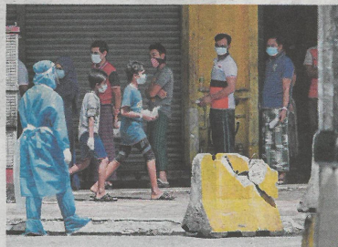
Foreign workers being screened for Covid-19 at the Selayang Wholesale Market in Kuala Lumpur on Saturday.