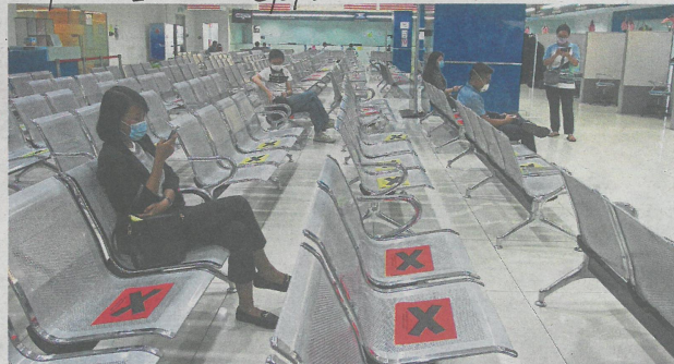
Back in business: Customers sitting on unmarked benches to maintain their social distance while waiting to be served at the Immigration Department office in Putrajaya.

restructured so that more civil servants can work from home. Only those whose work is in line with efforts to revive the economy should be working from the office," he said.