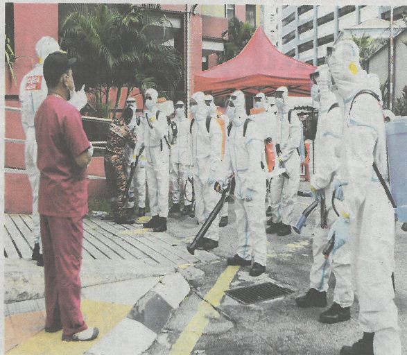
ANGGOTA bomba mendengar taklimat sebelum melakukan semburan nyah kuman di kawasan PKPD di Menara City One, Kuala Lumpur tidak lama dulu.

"Ya, memang terdapat permintaan daripada mereka (PBT dan kerajaan negeri) untuk mendisinfeksi kerana